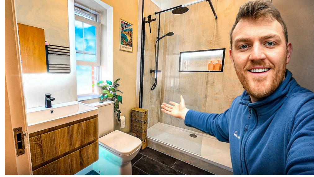
Bathroom Renovations Vancouver - Custom Bathroom Design and Bathroom Remodeling Experts 1771 Comox St, Vancouver, BC V6G 2M6