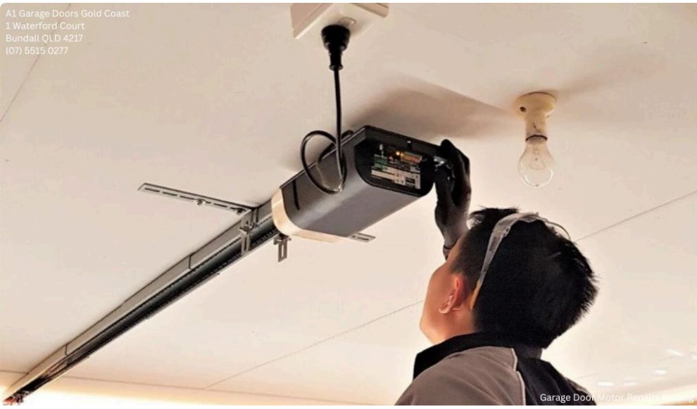
Garage Door Motor Repair Service